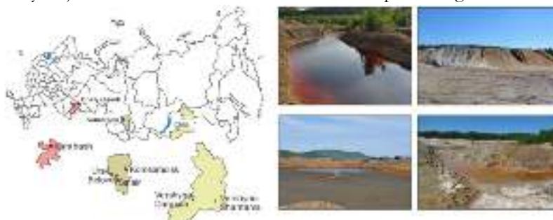
Figure 1. The layout and photos of the study objects

The recent investigation aims to detect mechanisms of chemical elements migration from the abandoned mine wastes and the ways of their immobilization. The main idea of the study is to assess the environmental damage and search for optimal methods to extract the valuable components, rebury the toxic residues and reclaim the contaminated areas. Study objects include abandoned wastes after the processing of sulfide-containing polymetallic ores located in the immediate vicinity of the living area in the Kemerovo Region (Komsomolsk, Ursk, Belovo, Salair) and the Trans-Baikal Territory (Vershyno-Shakhtama and Vershyno-Darasuntowns, Fig.1).